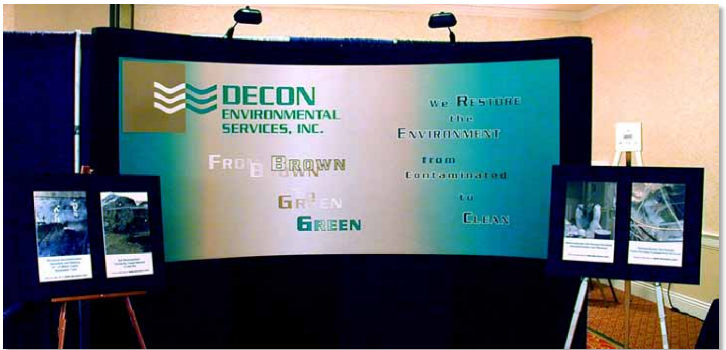
Tradeshow execution for SSHA 2007 (Interactive element not shown)