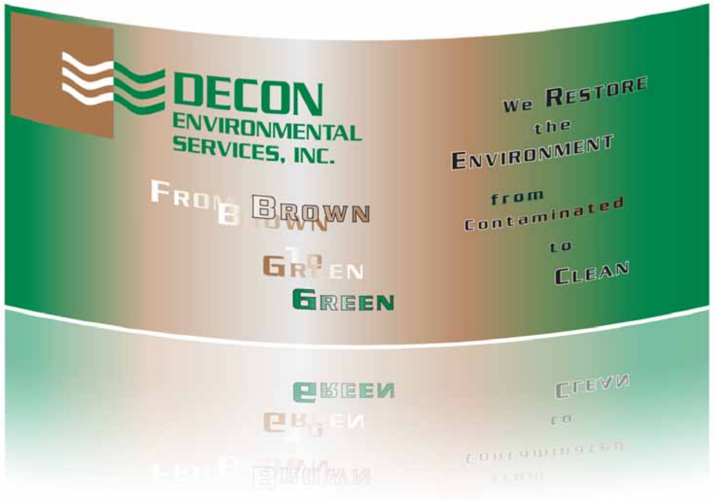
Tradeshaw booth concept for SESH 2007